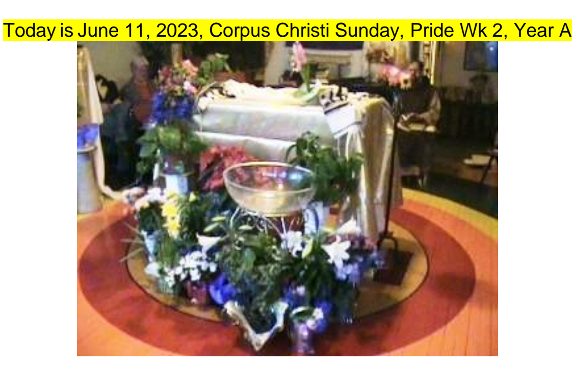
Ray Of Hope Church began on 10/31/1983.

Pastor: We come here to pray. Each person is an equal and active partner in all we do in the next 90 minutes. At Ray Of Hope, the worship event is not a spectator's activity where people come to hear some good music and a teaching/lecture. Instead, each person's primary responsibility is to pray during each section of the "service" actively. The definition of the word liturgy is the prayer-work of the people. The people lead, serve, organize, and facilitate this public time of assembly to worship and experience God and one another. The people are actively praying and serving each person present and God.